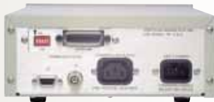
Rear view of Model 186 with IEEE-488 option installed.

Modem connections require a modem on both the host computer and the remote instrument equipped with the RS-232 option. Use of the Serial port with RS-232 does not require a phone line and gives users an effective remote monitoring range of 50 feet. By choosing the RS-422 option on an AMI instrument or using converters, effective range is approximately 4,000 feet. Instruments in multiple locations can easily be monitored with a single host computer by simply selecting them from the user defined pull down menu.